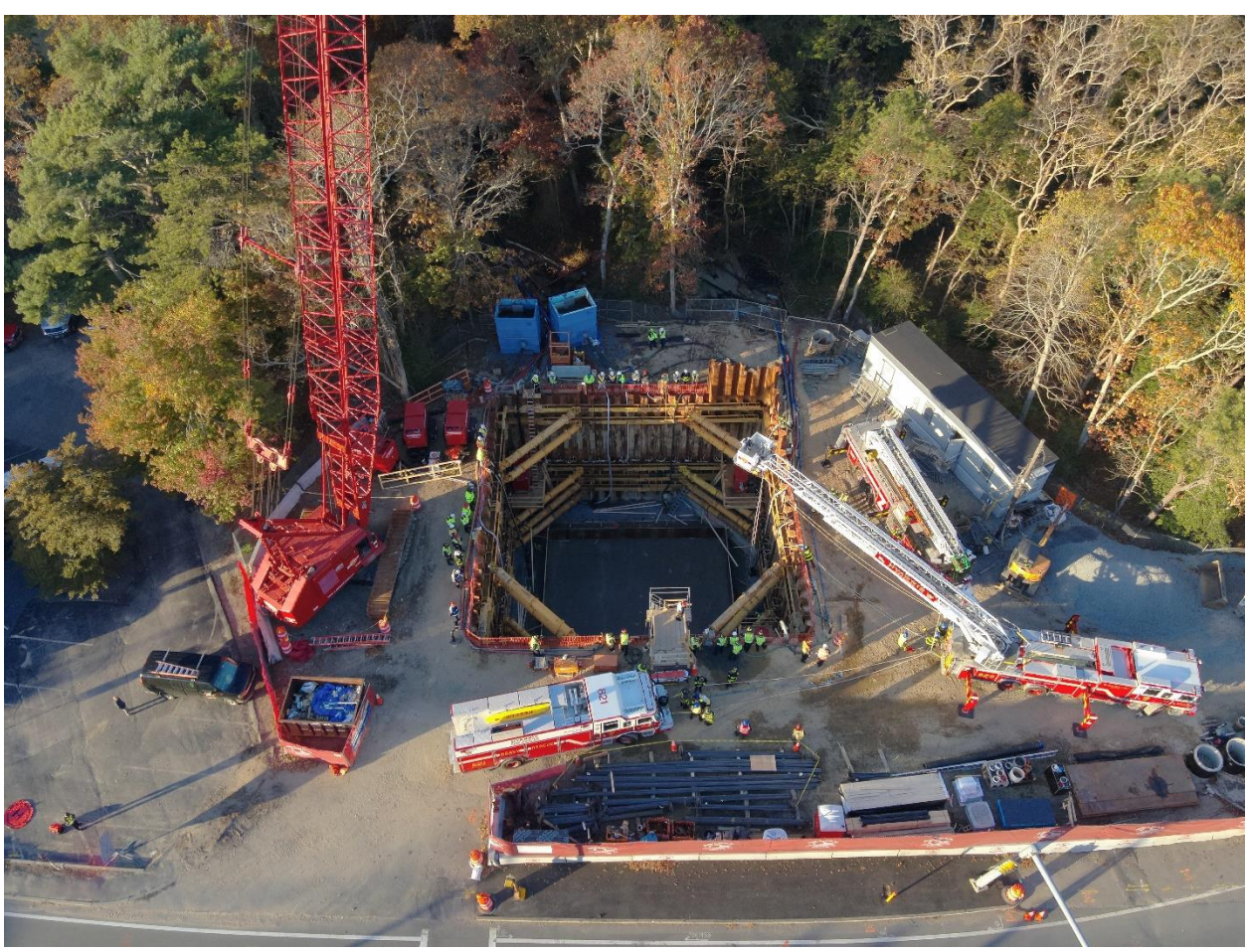
(Phinneys and Route 28 Drill 09Nov22 C-O-MM Fire, Hyannis Fire, Barnstable Police, Barnstable County Tech Rescue Team)

In addition, these infrastructure updates have placed new challenges on our emergency responders requiring added training to prepare for and responding to confined space rescues and trench collapses.